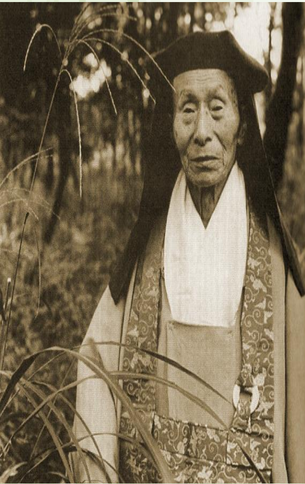
Harada Daiun Sogaku